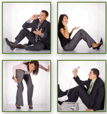
*Training outside the box

The sales team is the “life force” of any organization. Today’s increased “commoditization” of products and services, as well as a “hypercompetitive” marketplace, demand that your sales people be the best at what they do. Harvest Marketing Partners has been helping companies deliver high impact sales training for over a decade. Our training programs are designed to fit the learning styles of your organization while helping you solve your unique marketplace challenges. *